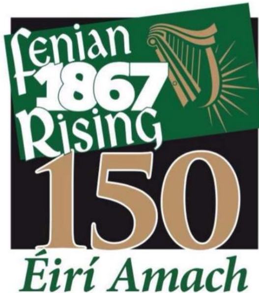
The Fenian Rising 150 years ago

For updates and information on additional upcoming events