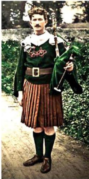
Death of Thomas Ashe 100 years ago