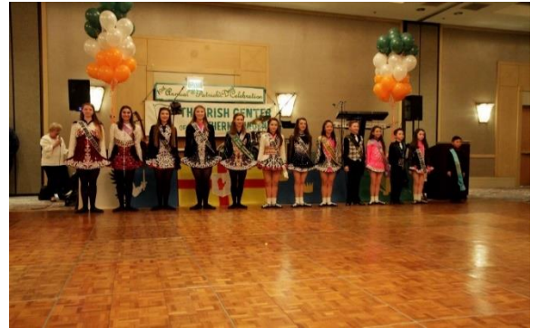
At the St. Patrick's Day Celebration, Hilton Hotel, Glendale Maggie Cleary School of Dance, Burbank