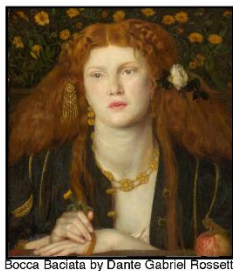
Bocca Baciata by Dante Gabriel Rossetti

Saturday, February 17, 2018 Noon-2:00 p.m.