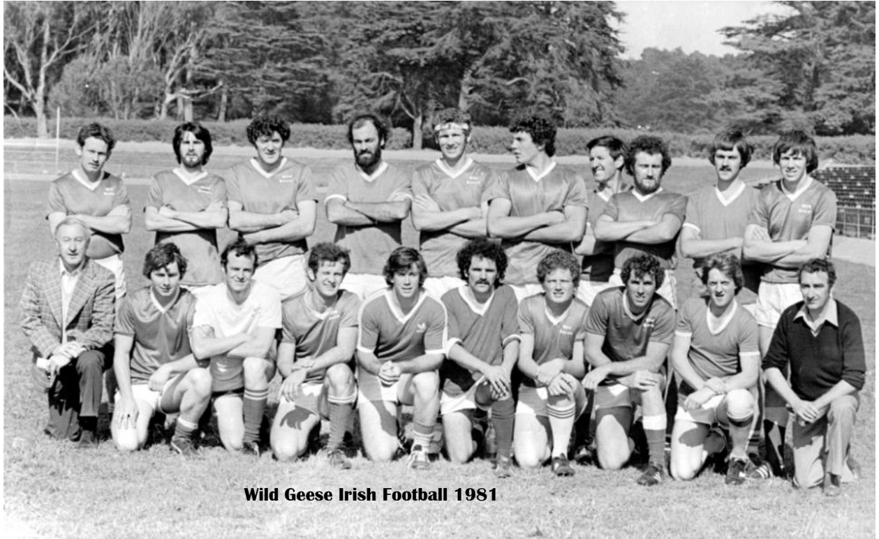
Wild Geese Irish Football 1981

WORKING TOGETHER TO ESTABLISH AN IRISH CULTURAL CENTER IN SOUTHERN CALIFORNIA