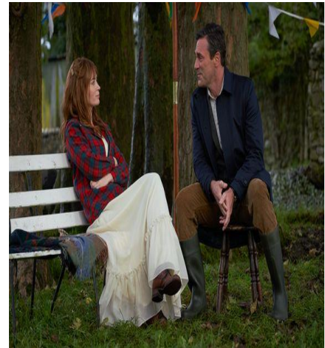
Emily Blunt and John Hamm in Wild Mountain Thyme.

“I told Emily Blunt when she called me up and said she wanted to do the part that we are not doing this movie for the Irish, because if you chase their love, you will end in failure. If you don't care, whether they like you or not, they may end up liking you. That's the only way. So we have to go our own way and not worry about that.