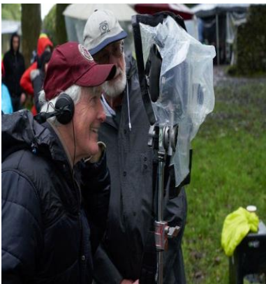
Director John Patrick Shanley.

“I try to come up with organic structures rather than contrived ones you know. Some of my screenplays are taught in film school and I have often thought I'd like to go and sit in on a class and find out what it was I did,” he laughs