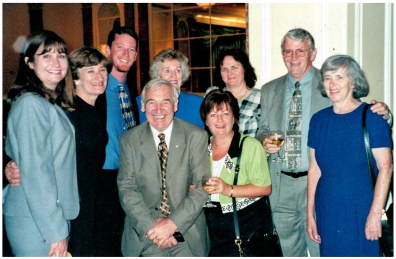
From some years ago