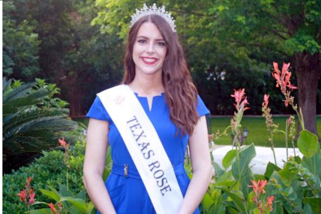
Texas Rose Of Tralee