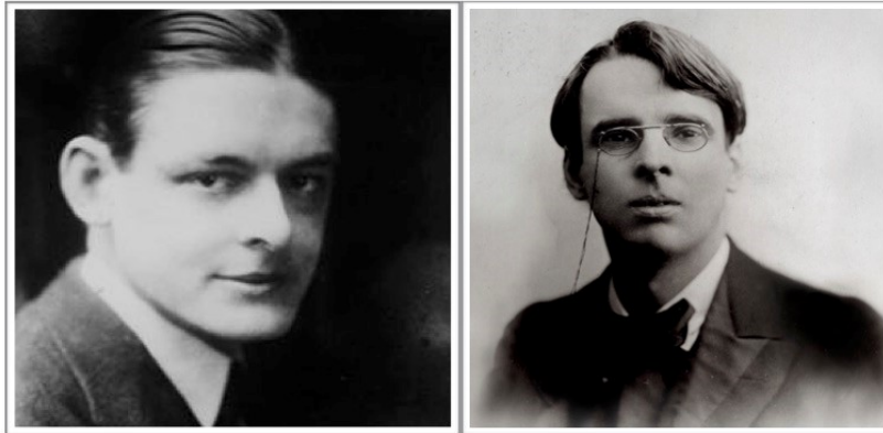
T.S. Eliot (9/26/1888 - 1/4/1965)