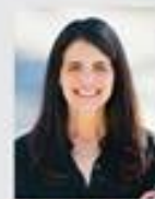
Nina Hachigian Deputy Mayor of International Trade, City of Los Angeles

For more information & tickets visit www.irelandweek.com