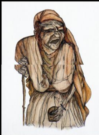
Beggar Woman, India 18" X 13" India ink on canvas board

OPENING RECEPTION: SATURDAY, 24 SEPTEMBER, 2-5PM