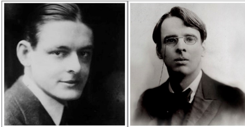
T.S. Eliot (9/26/1888 - 1/4/1965)