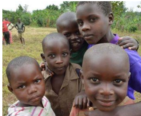
Local children say “Hi”