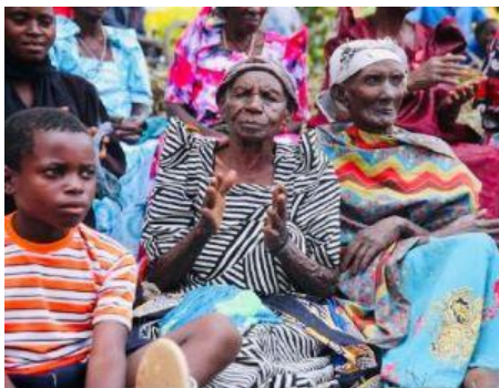
Local villagers dress up to welcome well donors