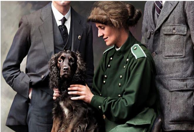
Countess Markievicz, one of the most important figures in the War of Independence, in Waterford in 1917

With a number of War of Independence centenaries taking place in 2020, the Irish Revolution has proved especially popular, Buckley said.